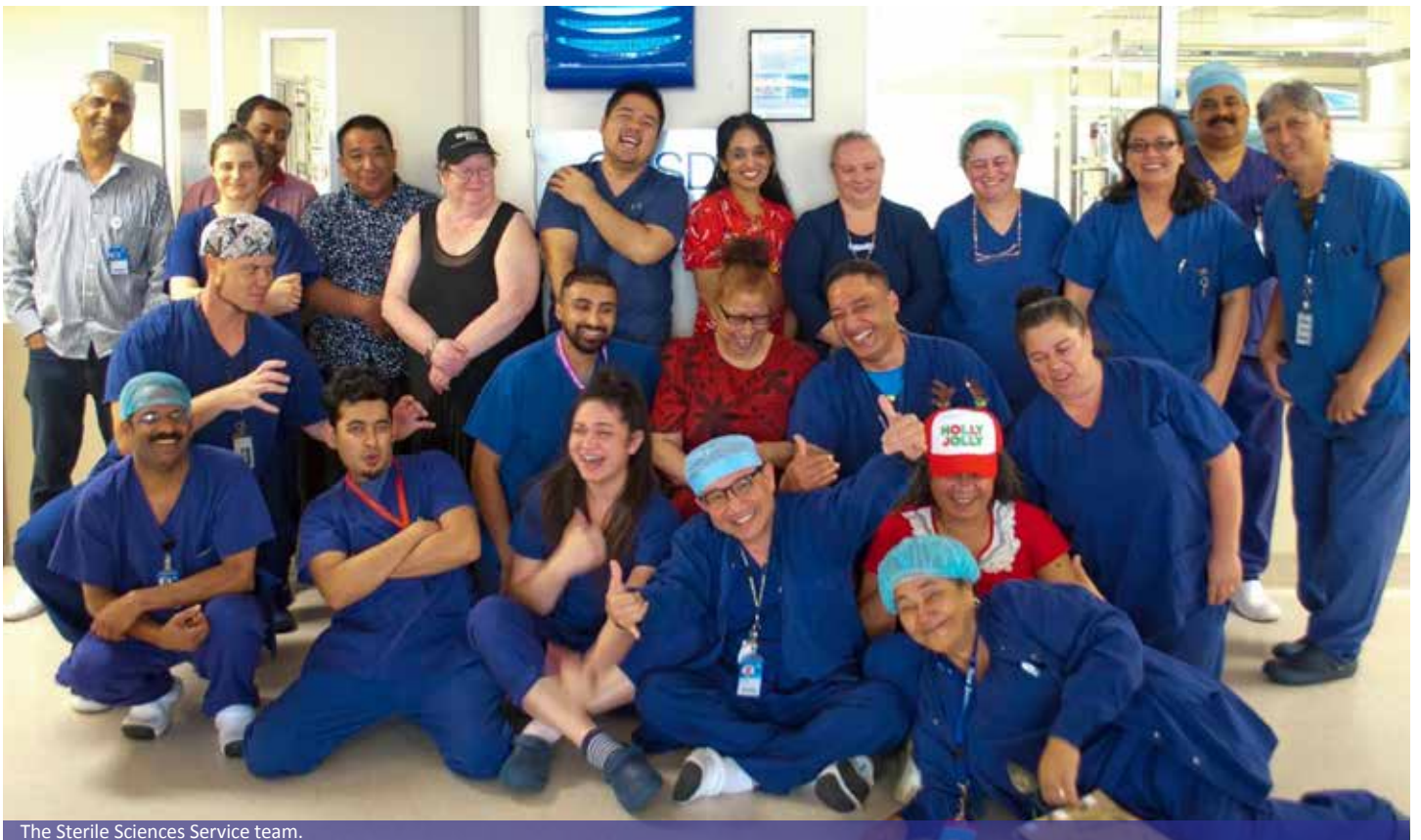
The Sterile Sciences Service team.

"Here, technicians check each piece of equipment by hand before packing them in containers to a 'recipe'. The 'recipe' basically lists all the instruments required for a particular